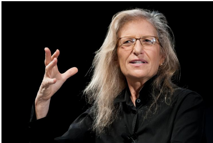
Photographic Artist Feature Annie Leibovitz