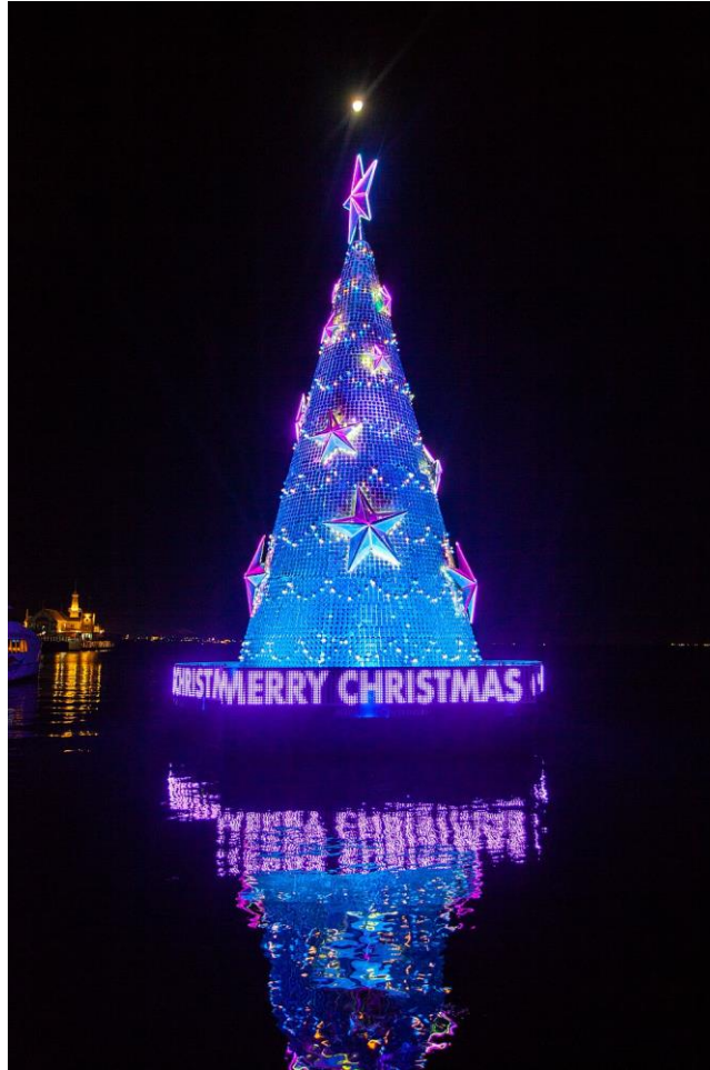
Floating Christmas Tree – Geelong

Even though we have had our end of year meeting, actually Christmas rings in the end of our activities. No doubt all the active judges have had a busy time dealing with club end of year, annual award night, meetings. This is the time when the results of our judging carry great responsibility, ensuring quality images based in aesthetics are recognized and potentially as submissions into national and international salons.